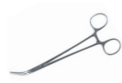
Fickling - Toothed