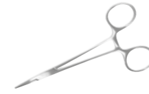
Mosquitos Curved 5"