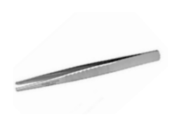
Treves Fine 5"