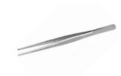
Treves/Semkin Extra-Fine 5"