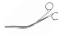
Cheatles 8" Autoclavable. Each. DCH310